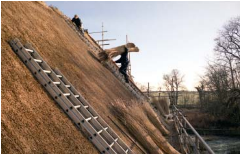
Thatchers at St.Margaret's Church Paston, February 2000.

It was an eventful year with disruptions caused by a change of builders which affected everybody else. However, when the time came for the rededication all (well, almost all) was put behind us.