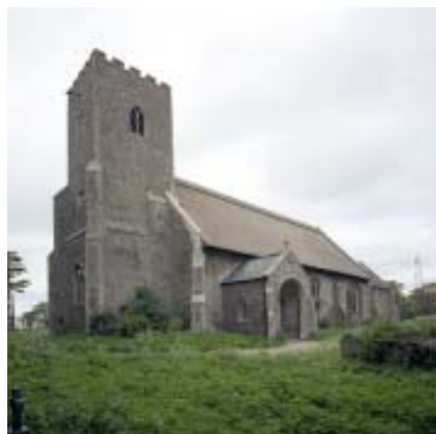
Rethatched Paston Church, June 2000.