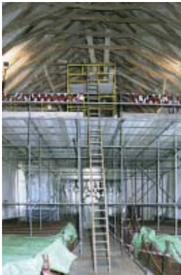
Interior, July 1999.