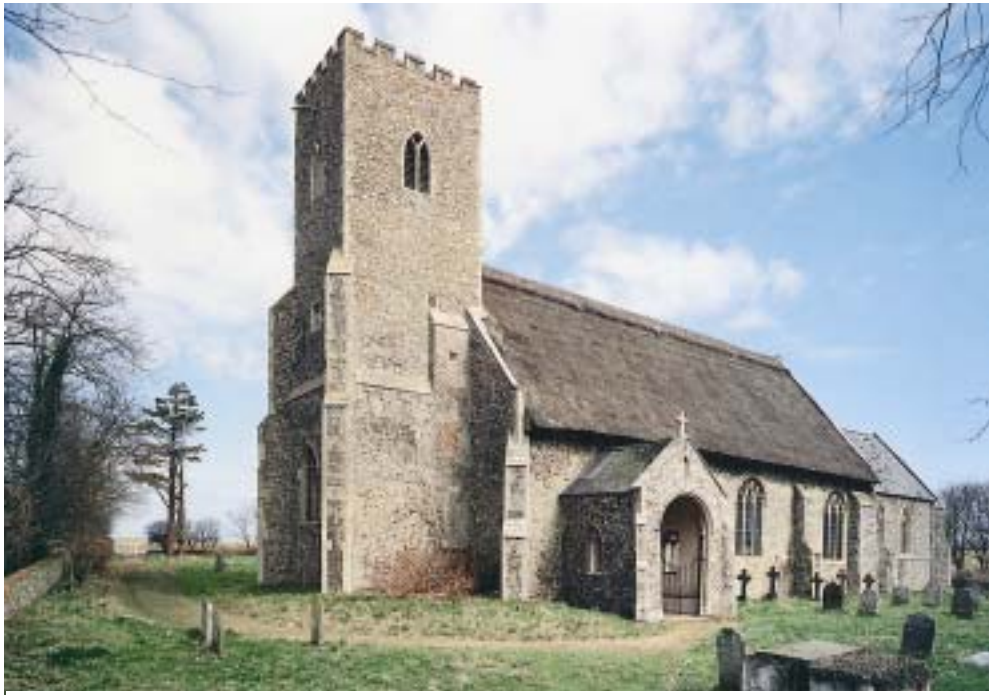
St.Margaret's Church, Paston