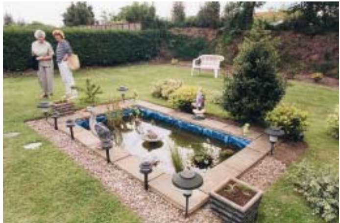
The garden of Tina & Brian Hall at 4 Mundesley Road