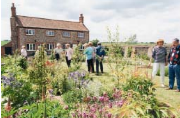
The garden of Wendy & Chris Young at 10 Bears Road