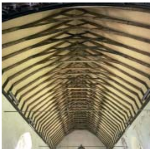
Refurbished roof interior, June 2000.

It was an eventful year with disruptions caused by a change of builders which affected everybody else. However, when the time came for the rededication all (well, almost all) was put behind us.