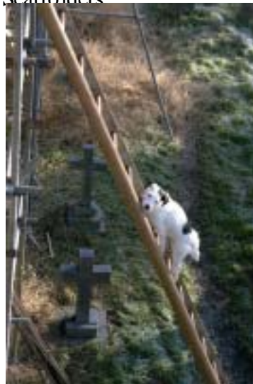
Thatcher's dog on ladder. February 2000.