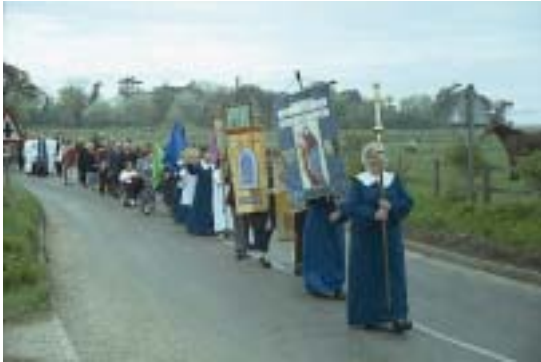
Procession to the Rededication service April 30th 2000.